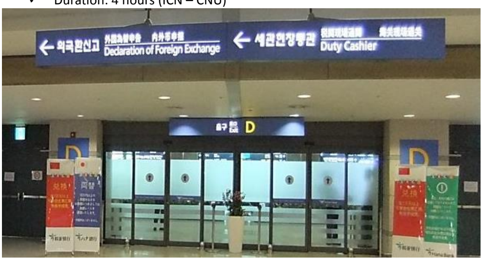
Please look for the Exit D to meet.