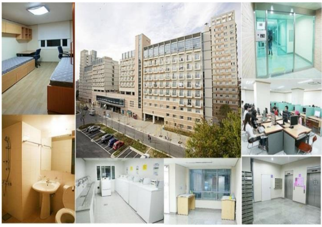
Dormitory Building 9 (BTL)